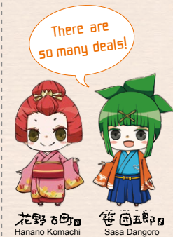
Mascots for Niigata, The City of Manga and Anime

L.O. stands for "last order" and is your last chance to order food before the kitchen closes.